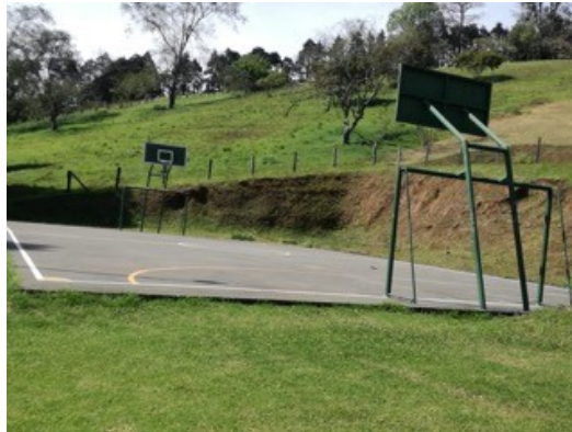
Camp Ochomogo, Costa Rica